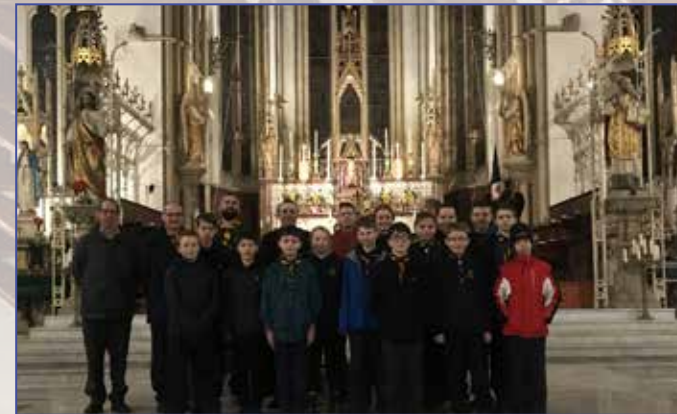
February: Visit of a local Scout group