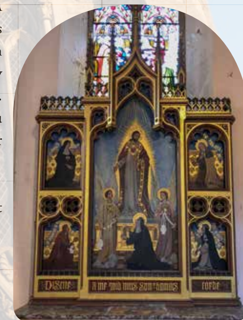
Sacred Heart Altar at English Martyrs'