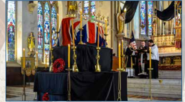
November: Remembrance Sunday