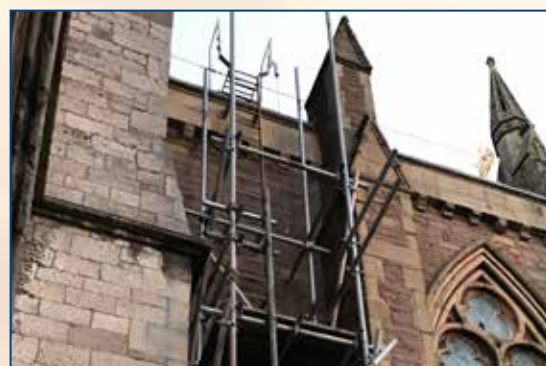
Scaffolding for the roof repairs completed last December.