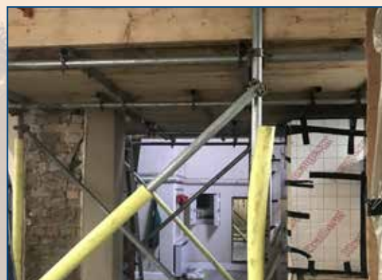
Work in the sacristy continues. With your help, it can be finished by July.