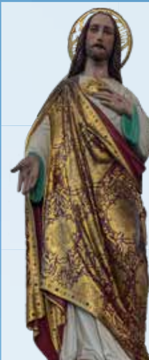
Statue of the Sacred Heart at the life of our Shrine at Preston over the St Walburge's

last few months, the progress of various work, and the apostolate of a silent and missionary life of prayer.