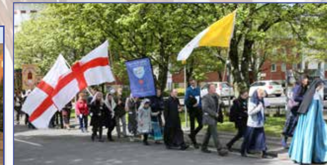
May: English Martyrs' Pilgrimage with the LMS