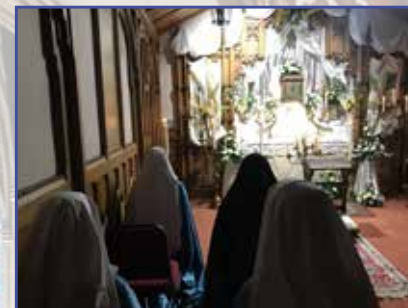
Maundy Thursday: The Sisters Adorers adoring at the Altar of Repose.