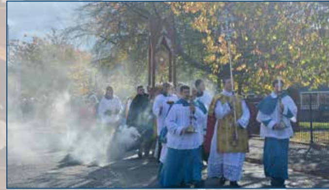
October: Blessed Sacrament Procession for the Feast of Christ the King