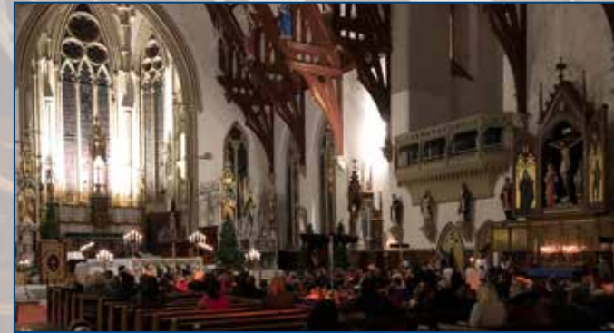
December: Christmas Carol Concert with local primary schools