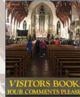
January: 'Spire at Night' tours.