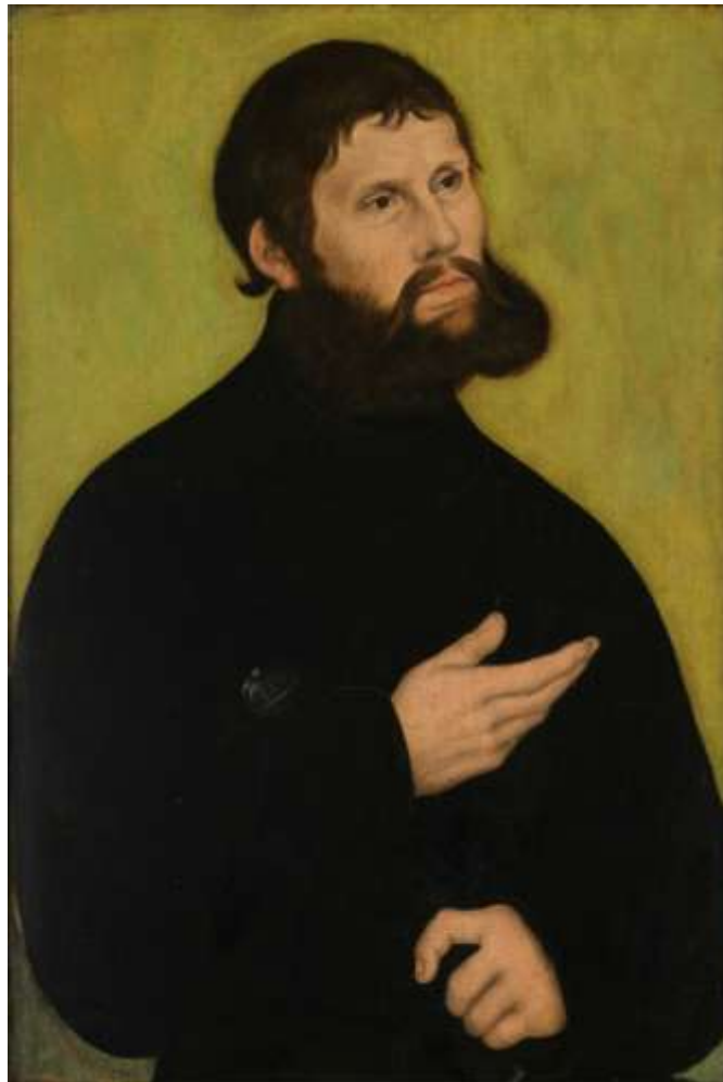
In order to protect the heretical monk, Elector Frederick III had him abducted and held captive at Wartburg Castle, where Luther remained for the following year disguised as an aristocrat called Junker Jörg. His sympathiser, Lucas Cranach the Elder, painted this portrait in 1522.

Luther’s notion of sola scriptura contradicts the Bible (e.g. 2 Thess 2:15) which upholds both Scripture and Tradition as a harmonious source for our Faith. The Church cherishes Sacred Scripture, while knowing the