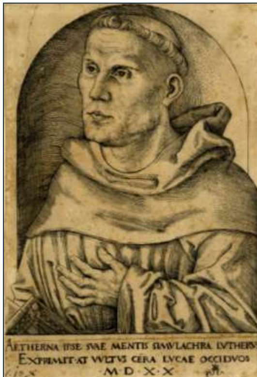
(Lucas Cranach the Elder, made this engraving of Luther as an Augustinian monk in 1520; and painted in 1526 this portrait of lapsed Cistercian nun Katharina von Bora, Luther's 'wife'.

Luther's aversion to the things of God extends to Sacred Scriptures. He dismissed the