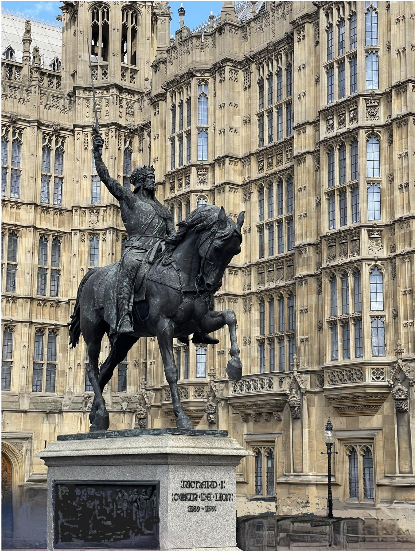
Statue of Crusader King Richard I the Lionheart outside the House of Parliament in Westminster, London