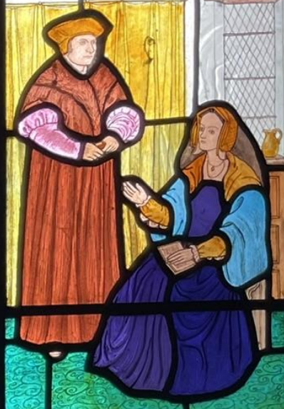
Patron of Humanist scholars, talking to Saint Thomas More