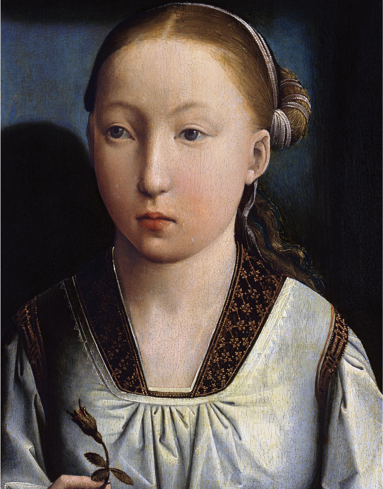
Portrait by Juan de Flandes thought to be of 11-year-old Catherine. c. 1496, Thyssen-Bornemisza Museum, Madrid.