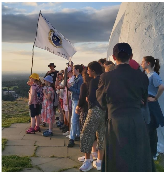
Photo: FSSP Summer Camp St Petronilla for Girls, 2024

Visit https://fssp.org.uk/manageprofile/register.php