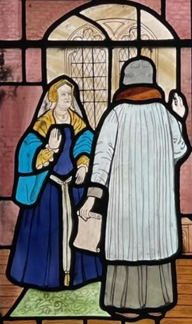
The second refusal to swear the oath of Succession - May 1534