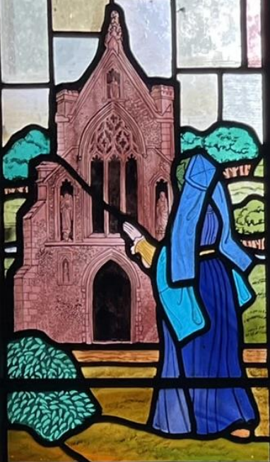
Queen Katherine a frequent pilgrim to Walsingham