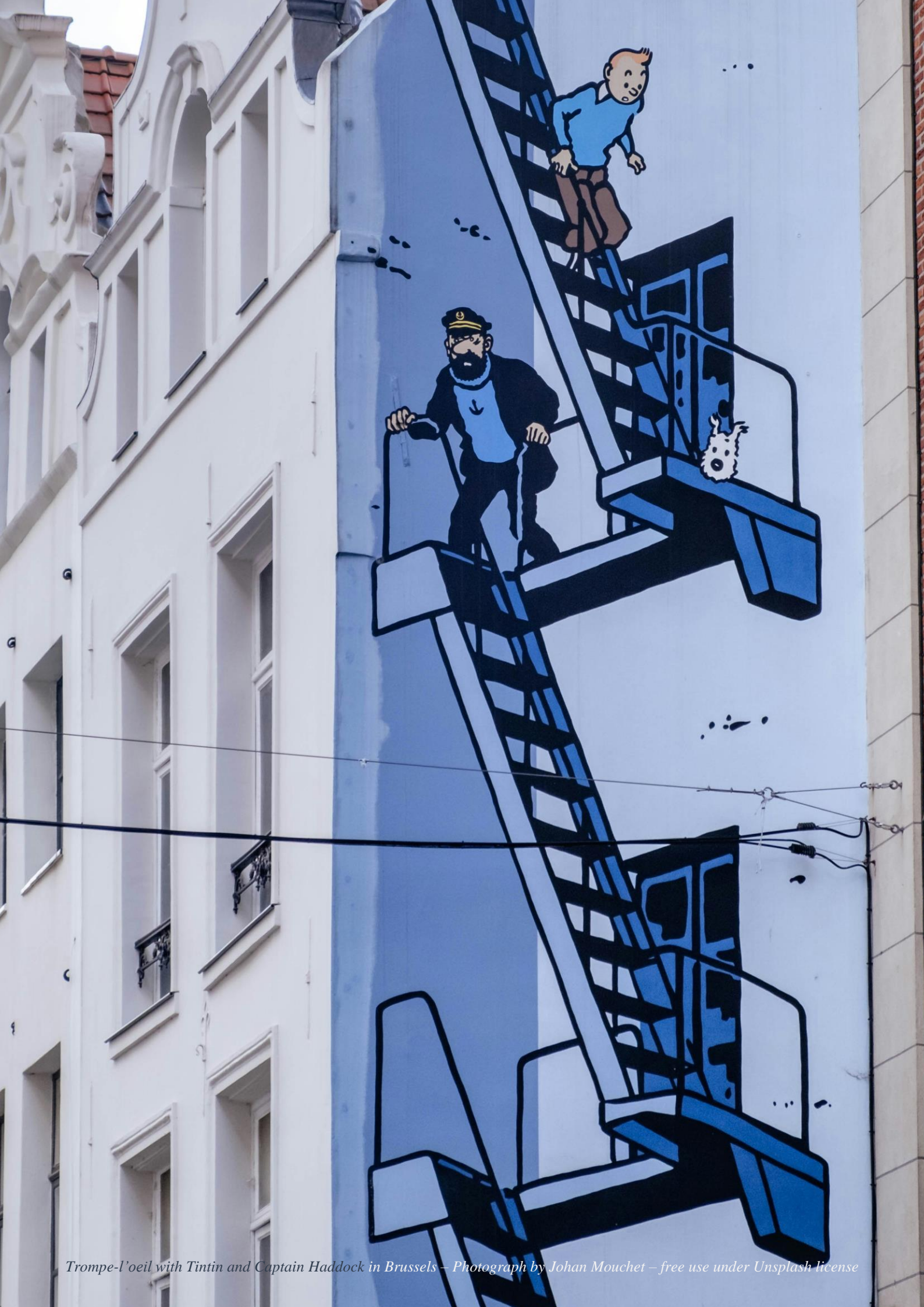
Trompe-l'oeil with Tintin and Captain Haddock in Brussels