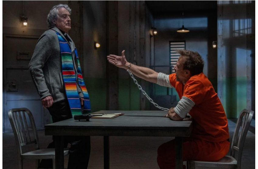
Photograph Nefarious film