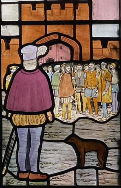
The Duke of Suffolk is foiled in his attempt to remove Queen Katherine from Buckden - December 1533